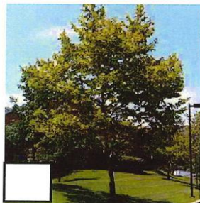
London Plane Tree